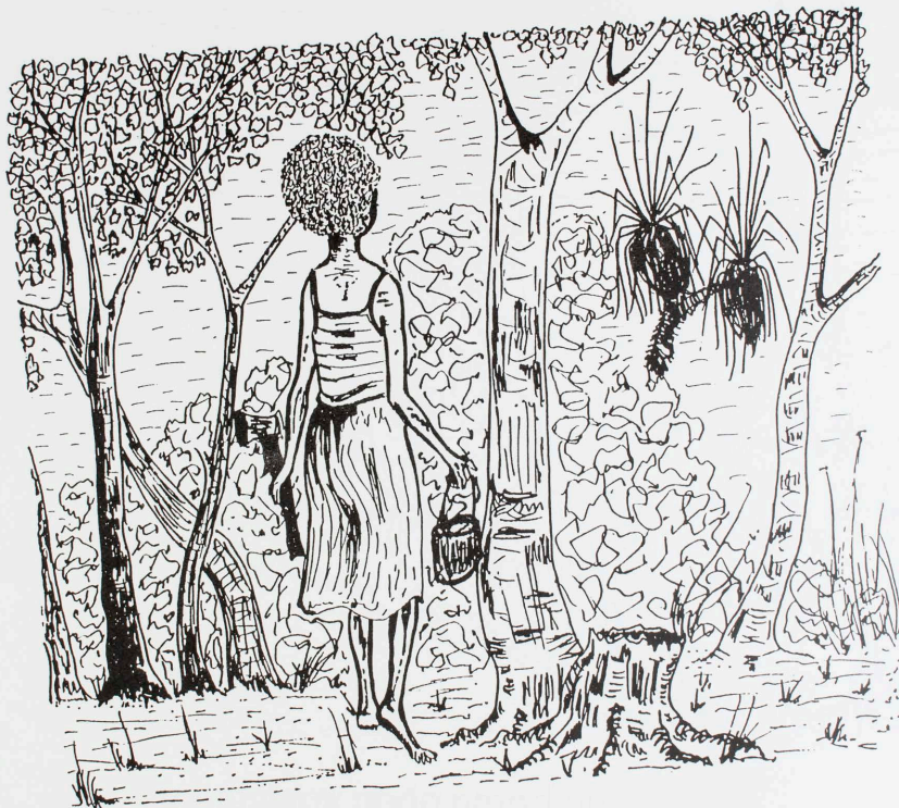
Yapa n̄arrunga diltjili