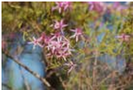
Ḷämbarr – Dhuwa Calytrix exstipulata Turkey Bush, Star flowers