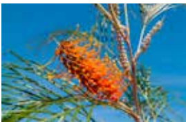
Yawuny – Yirritja Grevillea pteridifolia Fern-leaved Grevillea