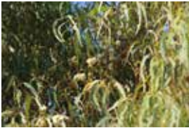
Gaḍayka – Dhuwa Eucalyptus tetradonta Darwin Stringybark