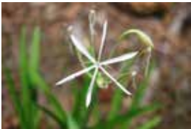
Wärrkarr – Yirritja Crinum asiaticum Swamp lily