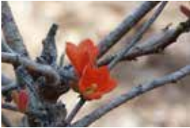
Dharrangulk – Dhuwa Brachychiton parodoxis Red-flowering Kurrajong